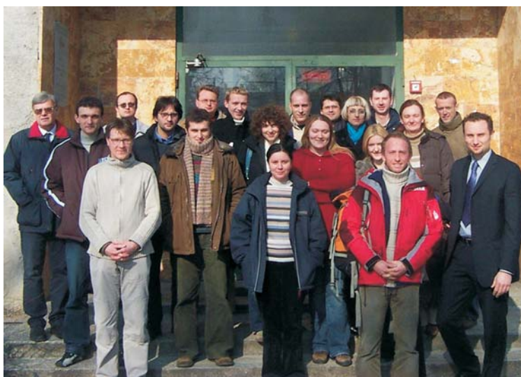
The participants of the course "Advanced GIS-modelling" Polaznici tečaja "Napredno GIS-modeliranje"

Osim rada u GIS-paketima, na tečaju su obrađivane i teme poput ovih: obrada satelitskih snimaka, modeliranje procesa u GIS-u, izrada ortofota, integracija GPS-a i GIS-a, modeliranje reljefa. Odabir tema, obavili su polaznici tečaja popunjavajući anketu.