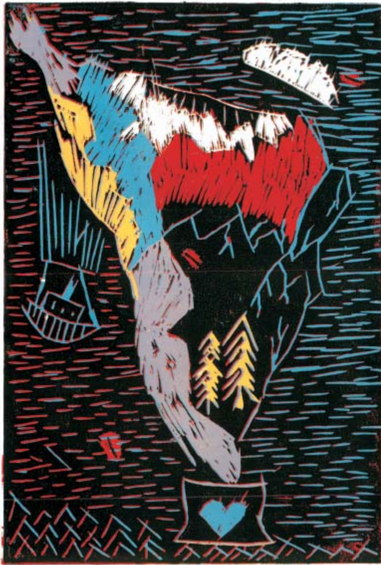
My World, Tamara Smetiško (age 14) Moj svijet, Tamara Smetiško (14 god.)

3, 205-206; Cartography and Geoinformation 2002, 1, 186-187). There were eight institutions with a total of 76 children's drawings.