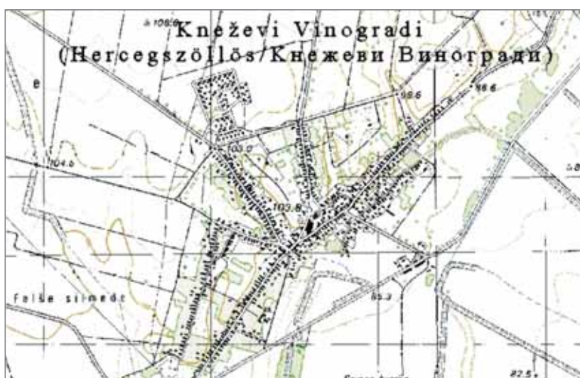
Fig. 2. Representation of minority geographical names Slika 2. Prikaz geografskih imena nacionalnih manjina

http://unstats.un.org/unsd/geoinfo/UNGEGN/ungegnConf10.html .