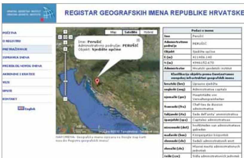
Fig. 1. User interface of the Record of Geographical Names of the Republic of Croatia Slika 1. Korisničko sučelje servisa Registra geografskih imena Republike Hrvatske

The national Report of Croatia was presented about geographical name