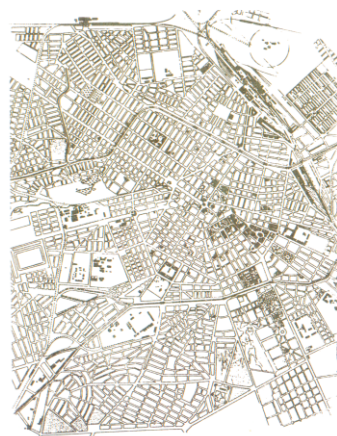
Fig. XII.20. Part of the plan of Big Sofia of 1938 of Prof. Adolf Musman

Napokon, Koceva zahvaljuje stručnim organizacijama vezanima uz geodeziju i kartografiju u Bugarskoj. Prva grupa inženjera-geodeta u Bugarskom inženjerskom i arhitektonskom društvu osnovana je 1922., a 1965. uspostavljen je Znanstveni i tehnički savez bugarskih geodeta i menadžera zemljišta, koji je 1990. preimenovan u Savez geodeta i menadžera u Bugarskoj. Posebnu pozornost posvećuje Udruzi geodetskih tvrtki koja je osnovana 1997. godine, Komori diplomiranih geodeta u Bugarskoj, osnovanoj 2006. i Bugarskom kartografskom društvu, osnovanom 2011. godine. Opisuje njihovu strukturu, aktivnosti i organizirana događanja.