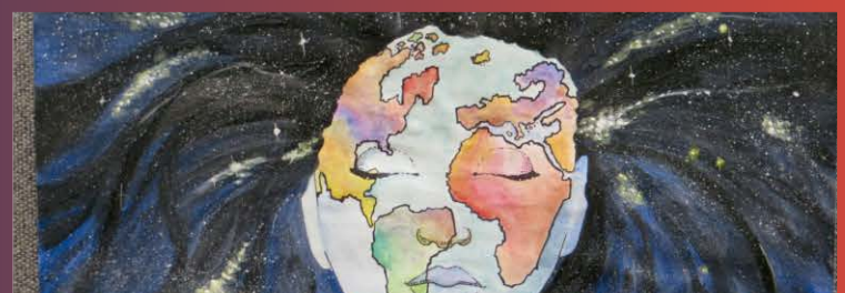
28th International Cartography Conference / 28. međunarodna kartografska konferencija Washington DC, USA, 2–7 July 2017 / Washington D.C., SAD, 2–7. srpnja 2017.