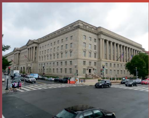
28th International Cartography Conference / 28. međunarodna kartografska konferencija Washington DC, USA, 2-7 July 2017 / Washington D.C., SAD, 2-7. srpnja 2017.