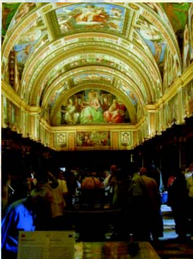
Knjižnica u Monasterio de El Escorial Library at Monasterio de El Escorial