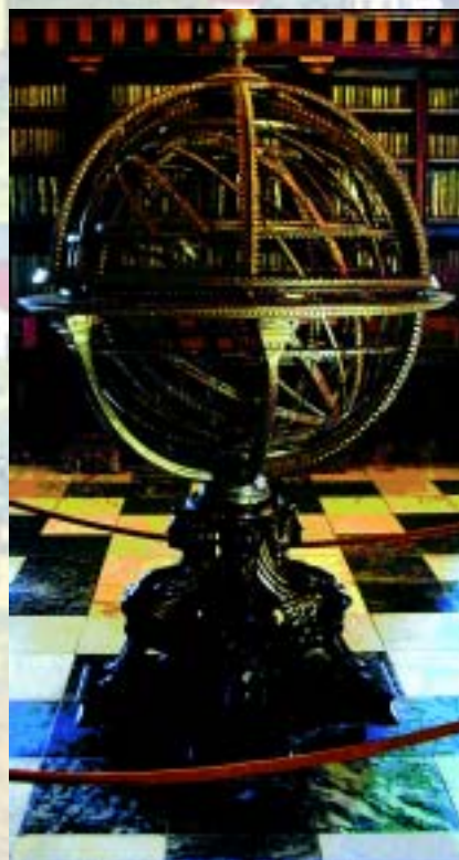
Armilarna sfera u knjižnici u Monasterio de El Escorial

Izlaganja i diskusije popraćene su trima izložbama: Blago španjolske kartografije (Treasures of Spanish cartography) postavljena je u Nacionalnoj knjižnici, Geografske knjige u Sveučilištu Complutense od davnina do 18. st. (Geography books in the Universidad Complutense from Antiquity to the XVIIIth Century) u